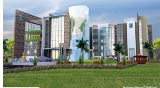
Proposed Atharva IT Park and International R&D Campus